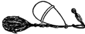
Attachment by eyelet in the end of spoon, LOWE STAR.