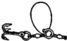
Attachment of spoon by split-ring, COLORADO SPINNER.