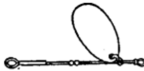
Attachment by "collar" or saddle around shaft, INDIANA SPINNER.