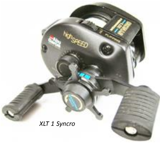
XLT 1 Syncro