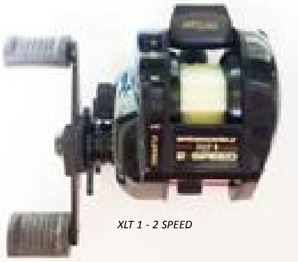
XLT 1 - 2 SPEED

The models of this family are a confusing lot of different names. The introduction of the Ambassador 500 and 300 model names was an unnecessary move by ABU which only put customers in doubt. The label, Ambassador 500, puts them below the 4000, 5000, 6000 classic Ambassadors in the hierarchy of ABU reels, but the XLT reels are actually ABUs top models. In retrospect more than one ABU representative I have talked to argue that the naming policy and the absence of a consistent profiling contributed to make them short lived models in ABUs program. One good suggestion was that they should have been called AutoMags and that the simpler (300's) should have carried on as UltraMags or just Mags. Well, it didn't happen.