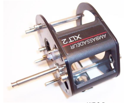
XLT 2 Frame

I used an XLT I Syncro and an XLT III 2 speed extensively for many years and I found them easy to service, reliable and powerful. The down side was the Polymer side caps which were difficult to maintain in good condition. Casting control was excellent, the power to wear out a big fish was there in ample quantity and I never experienced mechanical problems. The reels just kept on spinning as they should no matter how much punishment I threw at them. To this day I see the XLT as one of the best reels from ABU.