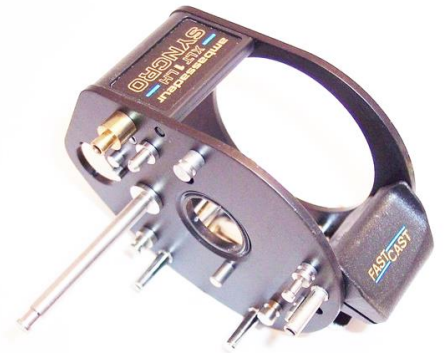
XLT 1 SYNCRO Frame

High tech frame design, graphite & metal spacers. There is no brake plate like the one you find in the 1021/22 and the 821/22/23.